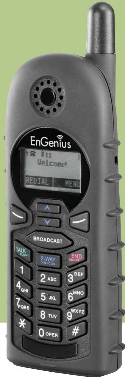
SN 902/ SP922 handset Actual size